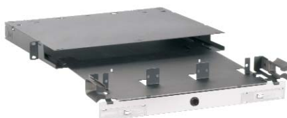
Opticom™ Rack Mount Fiber Enclosures